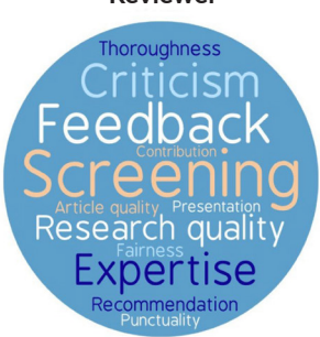
Fig. 1. Word clouds summarizing the elements coded based on surveys came in from Web of Science-WoS publication corresponding authors to identify the perceived roles of Editors-in-Chiefs Associate Editors, and Reviewers.